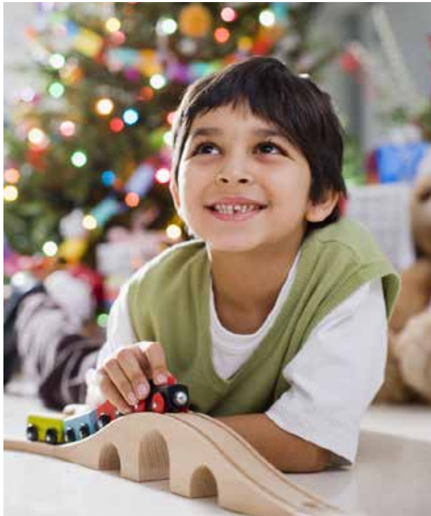
Shortly thereafter, the U.S. CPSC officially issued a second recall.

Similar problems arose with certain Samsung Galaxy Note 7 phones in late 2016. The phone was recalled officially in the United States through Samsung, and the company launched exchange programs in other countries. Even replacement models continued to have problems, as some caught on fire in early October. Samsung ultimately told Note 7 owners to stop using the phones and return them before permanently discontinuing the product.